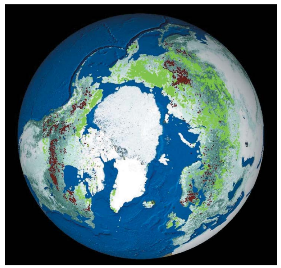
Fig. 1. Spatial distribution of trends in May to August photosynthetic activity (Pg) across the northern high latitudes from 1981 through 2005. Significant positive trends in Pg are shown in green, and negative trends are shown in rust. Areas of croplands, identified by the GLC2000 land cover data set (http://www-gvm.jrc.it/glc2000/), are not included in the analyses. The trends in Pg are overlaid on the percent of tree cover layer from the MODIS Vegetation Continuous Fields product (http://glcf.umiacs.umd.edu/data/vcf/) and show that most of the positive trends in Pg occur in areas with little or no forest.

These observations typically show large spatial and temporal variability, requiring a more nuanced framework for understanding how changes in high-latitude ecosystems